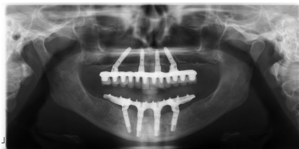
Figure 3 Panoramic radiograph following delivery of definitive prostheses for the maxilla and mandible. The maxillary CM Prosthesis consists of a milled titanium framework with individual lithium disilicate crowns. The mandibular prosthesis is a milled titanium framework veneered with acrylic resin and denture teeth.

orientation were found to be statistically insignificant (MANOVA; p > 0.05 ). Examples of preoperation and post-operation radiographs are depicted in Figures 1 and 2. Figure 3 illustrates a radiograph following delivery of the definitive prostheses in the same patient.