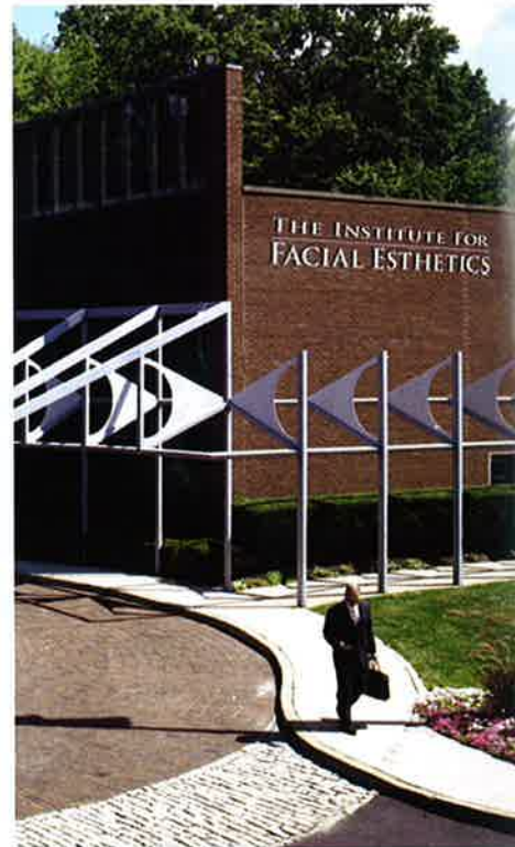
The Prosthodontics Intermedica building at The Institute for Facial Esthetics in Fort Washington.